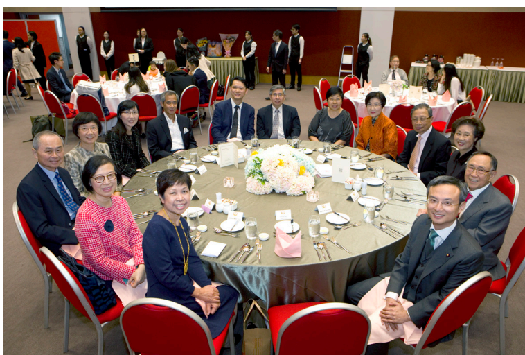
College Presidents with honorable guests at the 28 th Annual Dinner on 30 November 2019