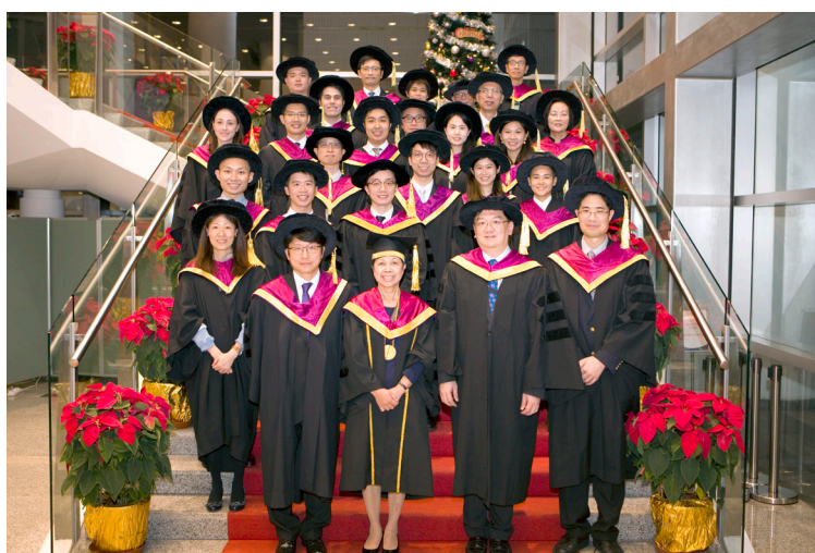
The College Council and the Newly Admitted Fellows at the 28 th Fellowship Admission Ceremony on 30 November 2019