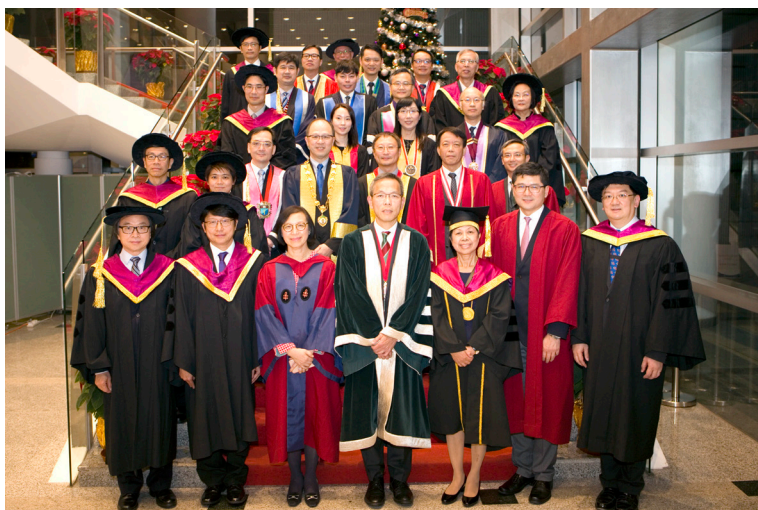
Honorable Guests, Presidents and Representatives of the Hong Kong Academy of Medicine and Sister Colleges, and the College Council At the 28 th Admission Ceremony on 30 November 2019