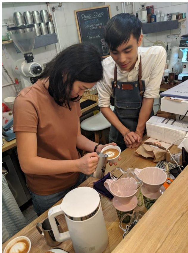
Young Fellows Subcommittee - Coffee-making

It has always been the aim of our subcommittee to connect young fellow members of our college with each other, organise social activities (see photo below), deliver professional knowledge, and bring the views of our fellow members to the attention of the college. In the future we hope to not only build connections within our own paediatric community, but to also create opportunities to work with society and collaborate with other young fellow societies locally and internationally.