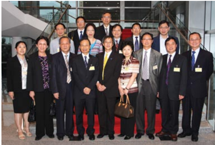
Organizing committee of the 7 th Guangdong/Hong Kong Paediatric Exchange Meeting & 1 st Guangdong/Hong Kong/Chongqing/Shanghai Paediatric Exchange Meeting