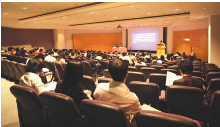
7 th Guangdong/Hong Kong Paediatric Exchange Scientific Meeting held on 28/6/2008