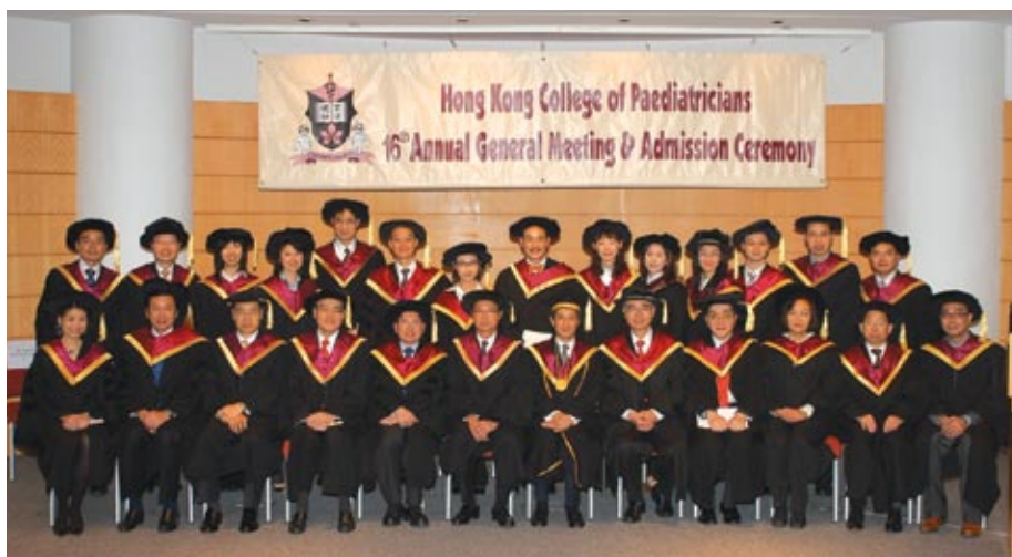
The College Council and the Newly Admitted Fellows at the Admission Ceremony on 1 st December, 2007.