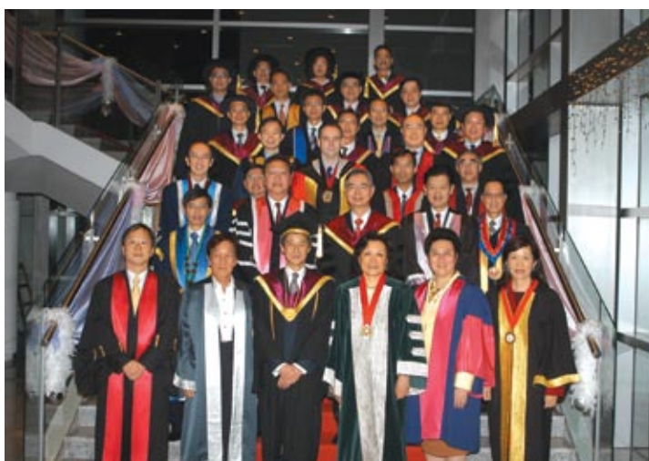
Honorable Guests, Presidents of Hong Kong Academy of Medicine, Sister Colleges and College Council at the Fellowship Admission Ceremony on 1 st December, 2007.