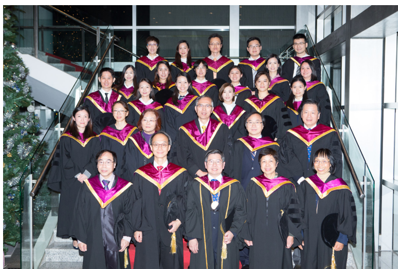
College Council and the Newly Admitted Fellows at the 23 rd Fellowship Admission Ceremony on 6 December 2014