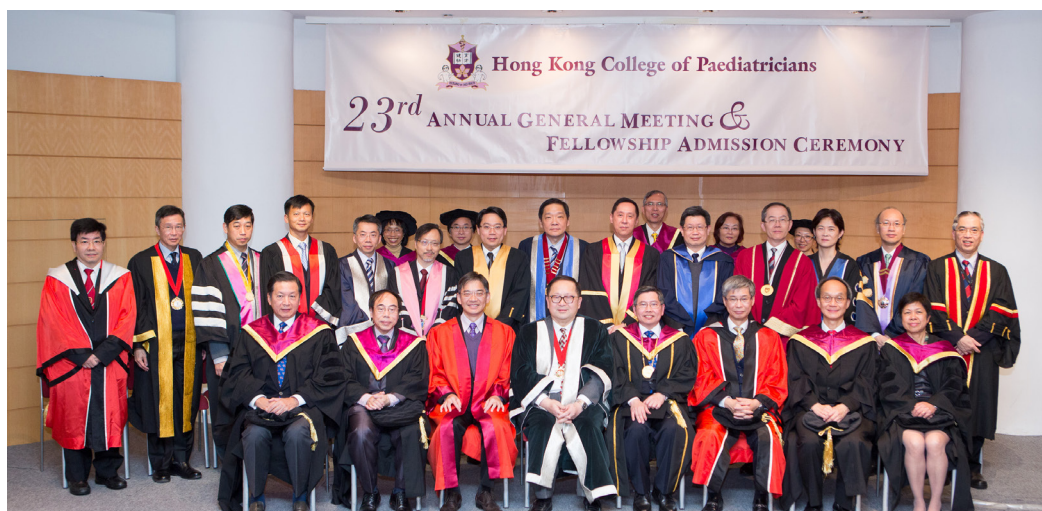
Honorable Guests, Presidents of the Hong Kong Academy of Medicine, Sister Colleges and the College Council at the 23 rd Admission Ceremony on 6 December 2014