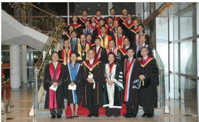
Honorable Guests, President of Hong Kong Academy of Medicine, Sister Colleges and College Council at the Fellowship Admission Ceremony on 3 rd December, 2005.