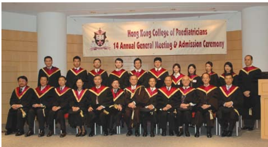
The College Council and the Newly Admitted Fellows at the Admission Ceremony on 3 rd December, 2005.