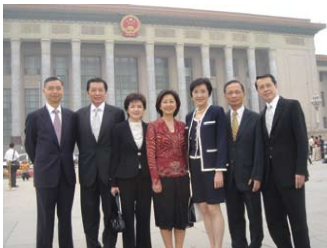
Delegates of the Hong Kong College of Paediatricians Foundation in the front of the Great Hall of People, Beijing for the Lauching Ceremony of Scholarship Presentation of the the HuaXia Foundation on 18 th May 2006.