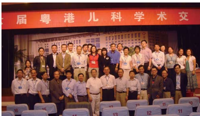
College participants at the 6 th Guangdong / Hong Kong Paediatric Exchange Meeting held in Dongguan on 25 th June 2006.