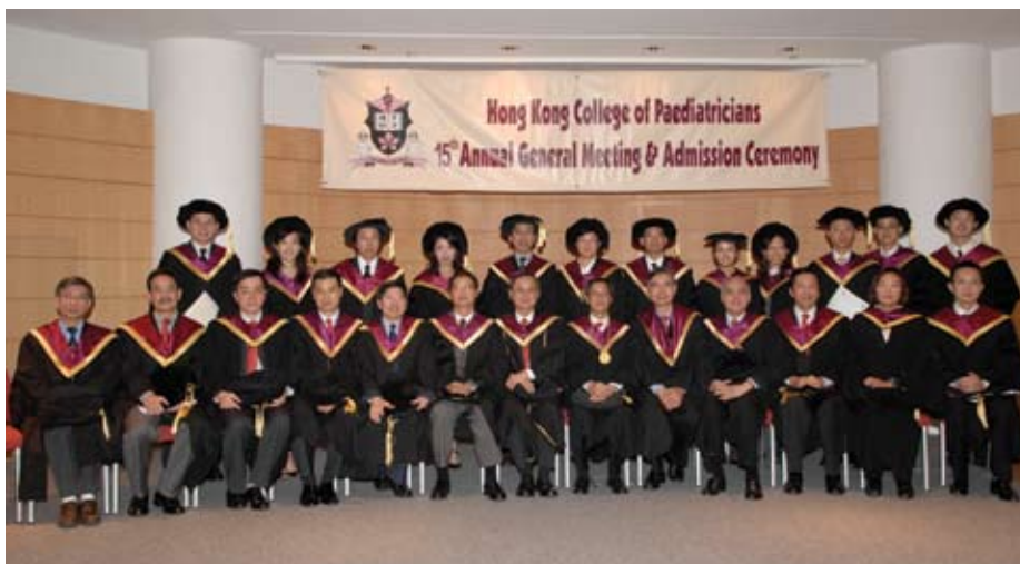
The College Council and the Newly Admitted Fellows at the Admission Ceremony on 9 th December, 2006.