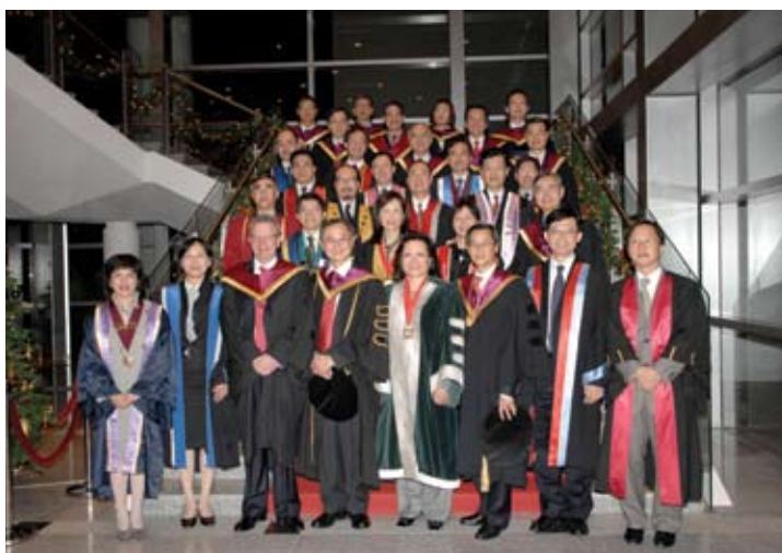
Honorable Guests, President of Hong Kong Academy of Medicine, Sister Colleges and College Council at the Fellowship Admission Ceremony on 9 th December, 2006.